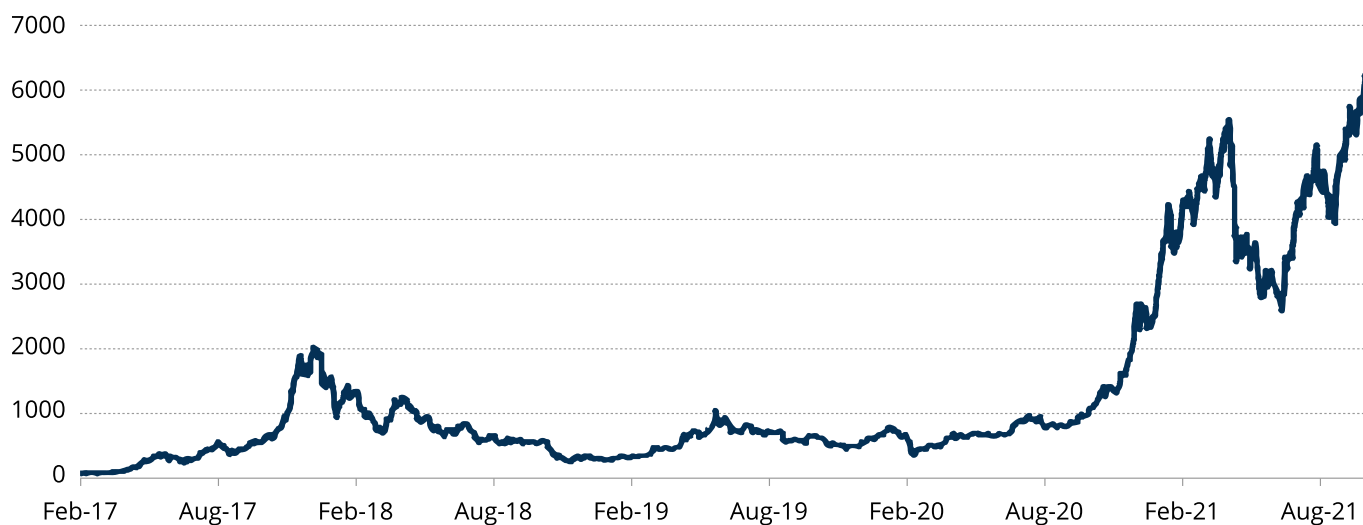
Performance of S&P Cryptocurrency Broad Digital Market Index – Feb ‘17 – Nov ‘21